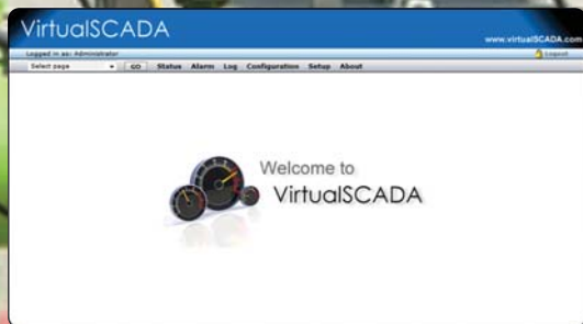
Actual Web-browser Screenshot

For more information visit us online at www.VirtualSCADA.com